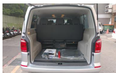
Vehicle Use for reference: GV2-5